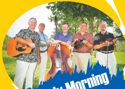
The Early Morning String Dusters bluegrass