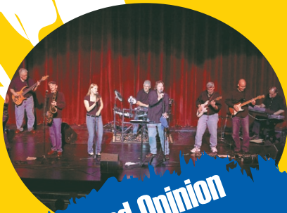
Second Opinion classic rock

Saturday, Feb. 19 at 8:00 p.m. + Historic Bijou Theatre